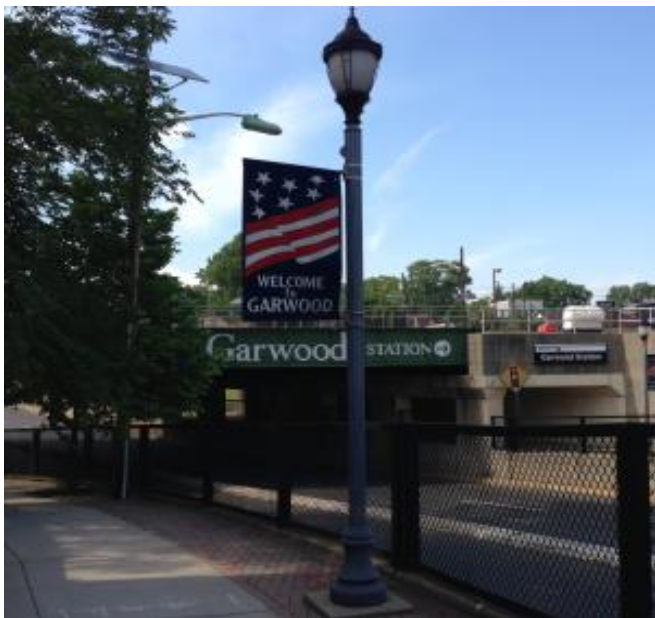
Downtown Garwood near train station.