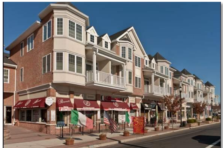
Mixed-use development on North Ave.

Garwood has a station located on the Raritan Valley Line that makes it easily accessible to New York City and other locations in New Jersey. In March 2014, NJ Transit introduced a "one-seat ride" with direct access to New York City on certain weekday off-peak trains. Garwood is also served by NJ Transit bus lines 113 and 59. Approximately 79.3% of working Garwood residents travel to work by private automobile and over 9.9% use public transportation. 52.1% worked in Union County and 7.8% worked outside New Jersey. The average commute time is 31.0 minutes.