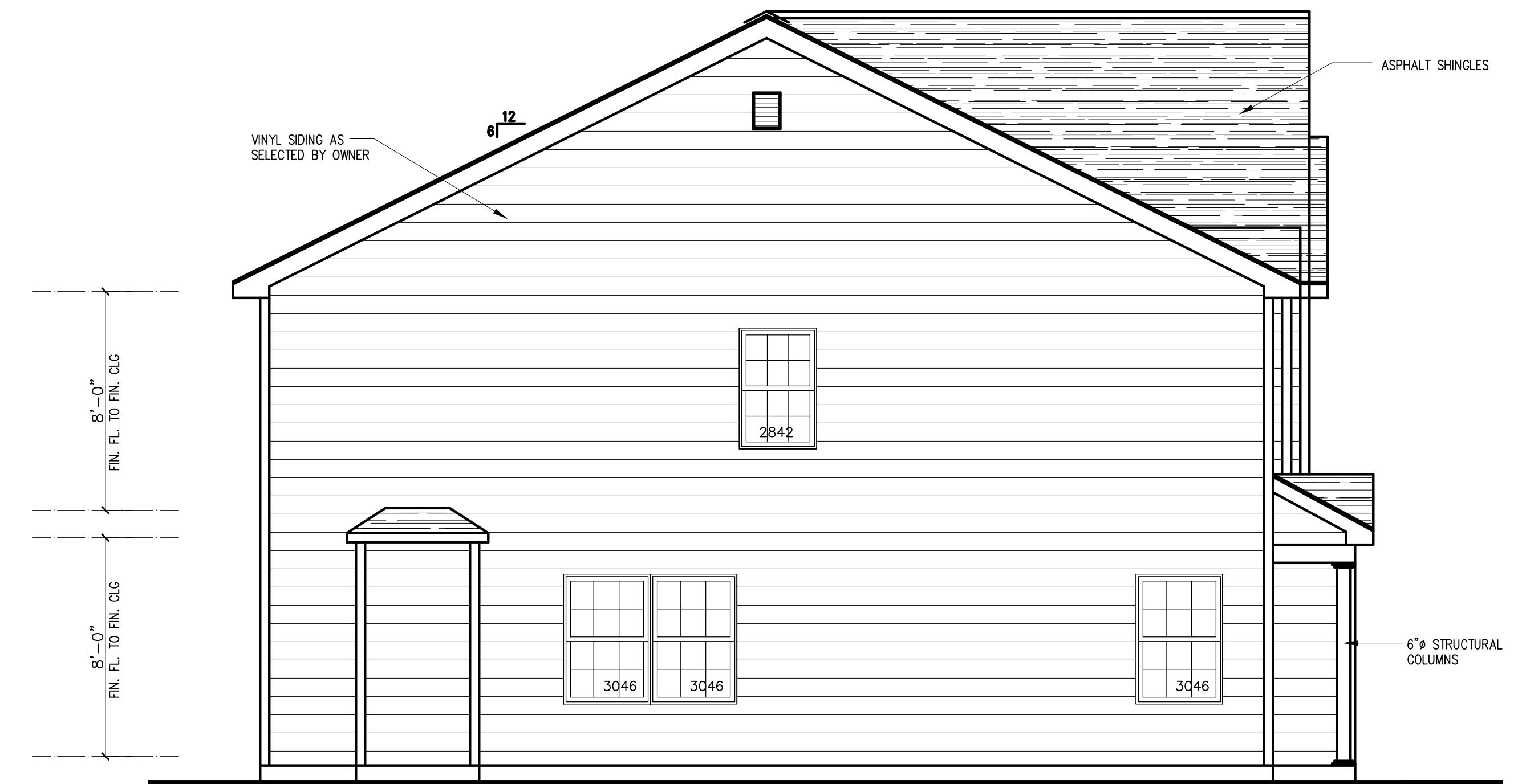
LEFT SIDE ELEVATION SCALE: 1/4" = 1'-0"