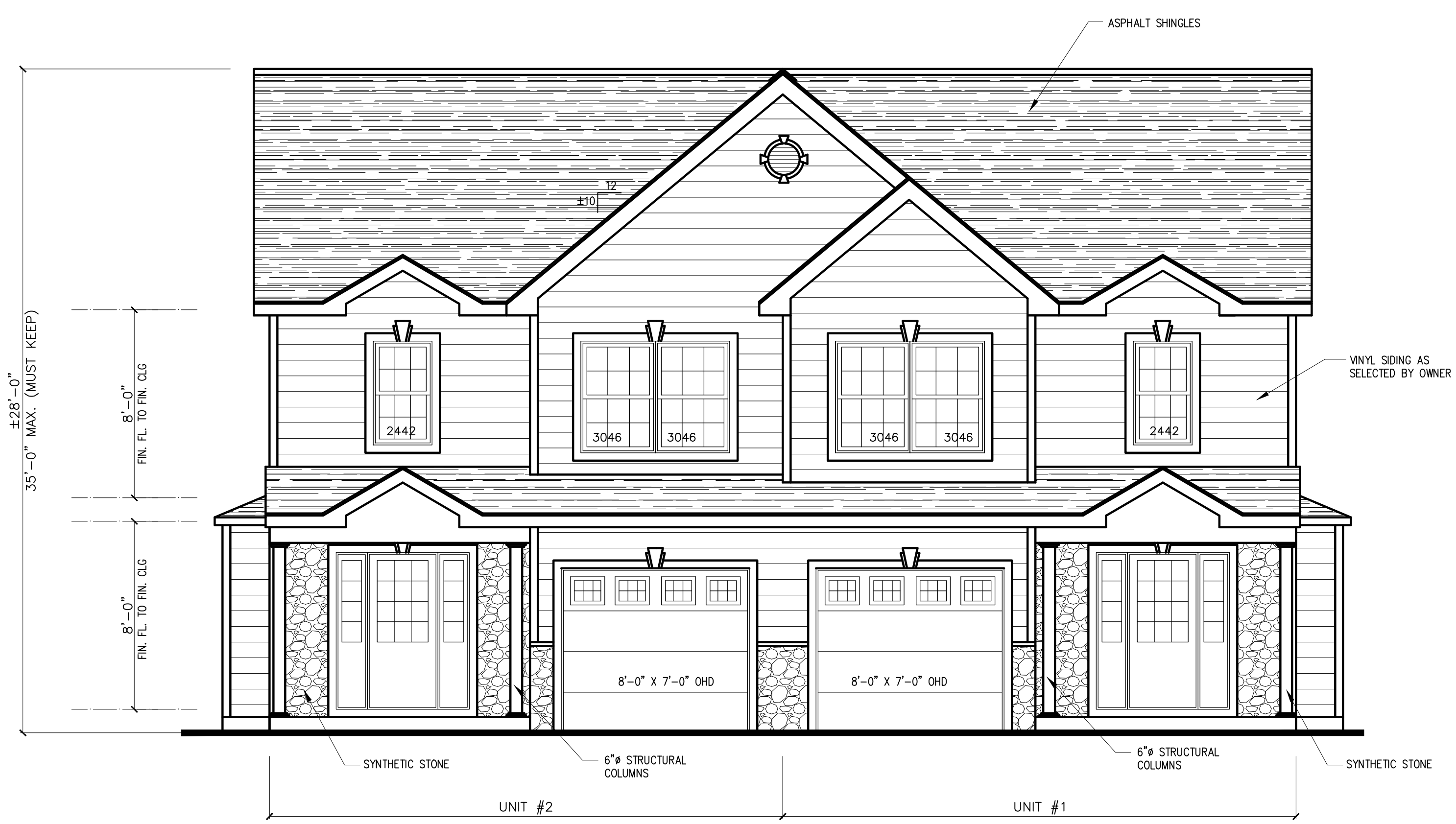
FRONT ELEVATION SCALE: 1/4" = 1'-0"